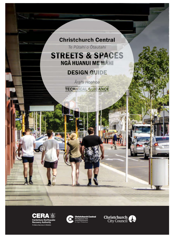
Figure 3 Technical Guidance book provides the suite of materials, street furniture and standard details to be used in public realm projects in the central city