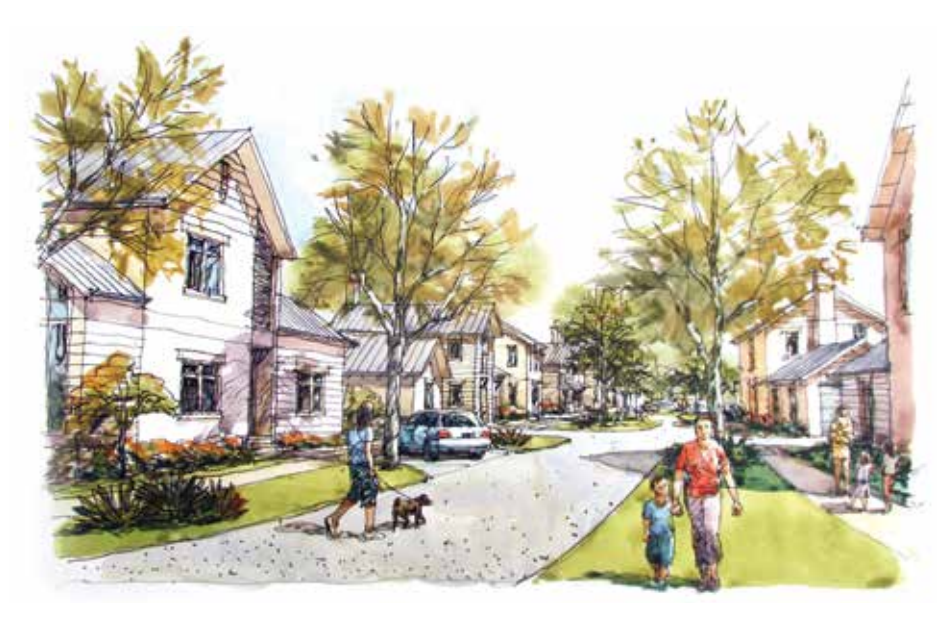
Artist's impression: Meadowlands subdivision in Halswell will be an example of what's possible in sustainable housing.