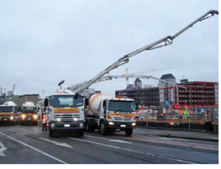
Hard at work: The foundation for the Bus Interchange takes shape. The Interchange is being constructed in a joint venture