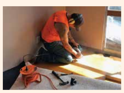
Pipi Schooner from City Care busy making repairs to a Housing New Zealand property in Buchanans Road.

Housing New Zealand is closing in on a significant milestone in its comprehensive repair programme across greater Christchurch.