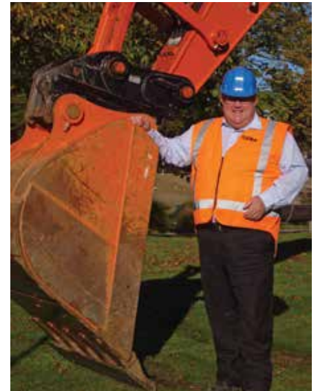
Minister for Canterbury Earthquake Recovery Gerry Brownlee became digger driver for the day on Saturday 23 March, turning the first sod on Te Papa Ōtākaro/Avon River Precinct. The Watermark project will include new pathways and landscaping, as well as a viewing platform over the river and curved concrete seating to create an amphitheatre-style space

"So we're really interested in community feedback on Watermark. Then we can feed that into the designs for the rest of Te Papa Ōtākaro/Avon River Precinct. If people don't like it or love it or have other ideas then maybe we can factor that into the balance of the project," says Mr Isaacs.