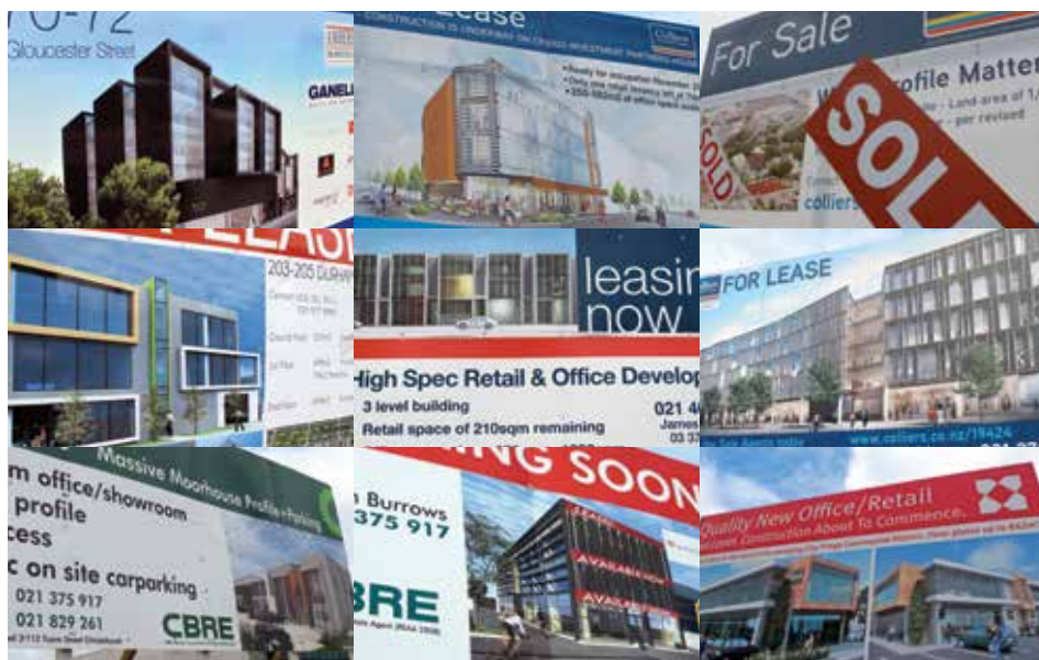
CBD billboards signal the rebuild is really gaining momentum