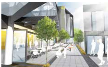
Artist's impression. 123, 131 and 133 Victoria Street will be built on by Christmas next year and a tree-lined boulevard with an outdoor café and restaurant space created

Three properties have already been rebuilt or repaired. Notably the two-storey Warren and Mahoney building (131 Victoria Street), which Countrywide bought on the day it was due to be demolished, has now been fully restored. A new six-storey office building is scheduled for completion in July of this year. Three more new builds of between four and six