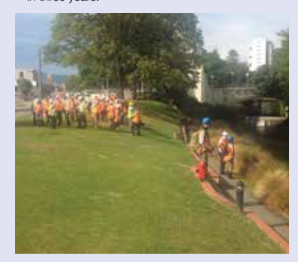
Members of Team Inaka met early in January for an information-gathering walk around the Ōtākaro/Avon River

CERA Canterbury Earthquake Recovery Authority