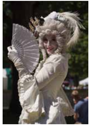
Cantabrians have remarked at the pleasure of hearing laughter and music ring out through the central city, thanks to the World Buskers Festival