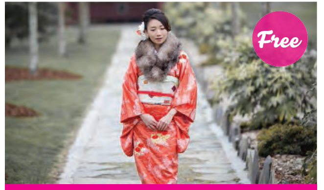
Canterbury Japan Day 6 March, 10am – 5pm Riccarton Park Function Centre

Bring your family and friends as the Christchurch Lantern Festival celebrates the Year of the Monkey. FREE