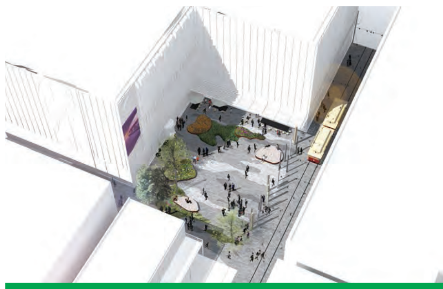
Artist's impression of the Innovation North courtyard on the corner of Poplar and Ash streets, showing the new Vodafone building.

connected, walkable and vibrant city centre for Christchurch. The work getting started will be completed in time for the openings of the new Vodafone and Kathmandu buildings