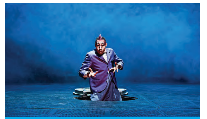
Cirque du Soleil - QUIDAM 17–25 February, 8pm, Horncastle Arena

The second ANZ cricket test. Various prices