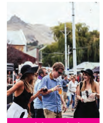
Nostalgia Festival 20 February 12.30pm – 7.30pm Ferrymead Heritage Park

Since premiering in 1996, Quidam has captivated millions of people across five continents. Now it's coming our way, with the same spell-binding production performed in arenas around the world.