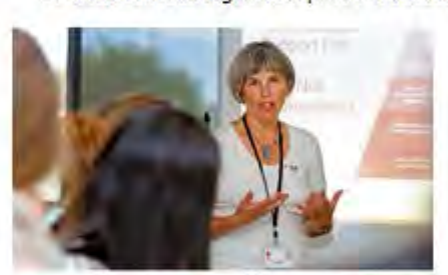
Recovery Matters workshops

Share understanding about psychosocial impacts experienced after a disaster and strategies to improve wellbeing