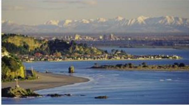
Connecting People, Land and Sea