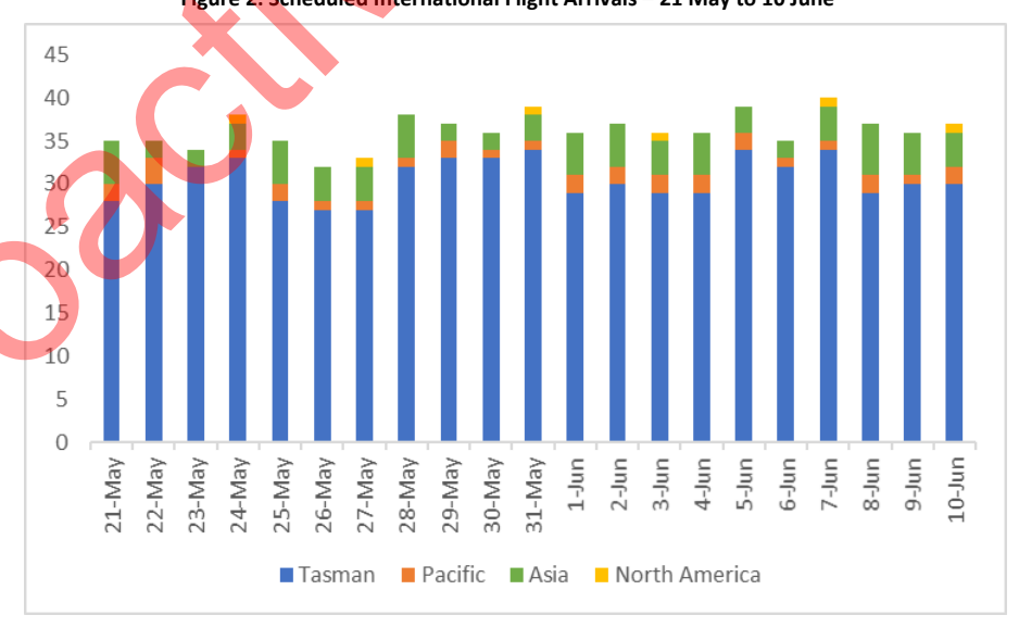
Figure 2: Scheduled International Flight Arrivals - 21 May to 10 June

There are 761 commercial flights<sup>2</sup> scheduled to arrive into New Zealand in the next three weeks (from 21 May to 10 June 2021) as shown in figure 2. On average, this is made up of 31 flights per day from Australia, 2 from the Pacific, and 4 from Asia.