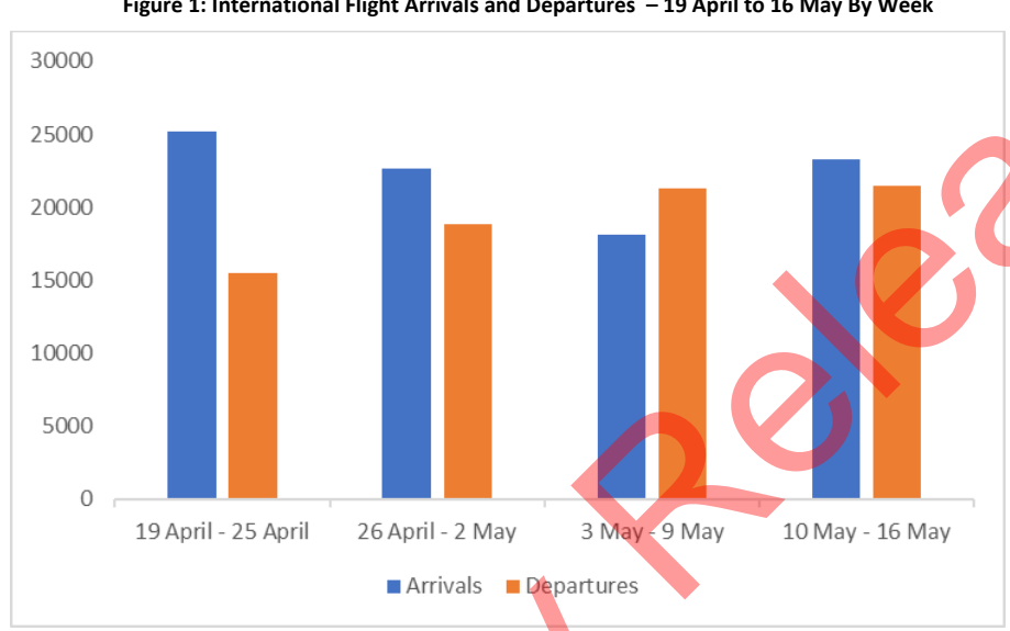
Figure 1: International Flight Arrivals and Departures - 19 April to 16 May By Week

For the period 19 April to 18 May (following the opening of Quarantine Free Travel with Australia), there were a total of 89,234 arrivals to New Zealand, and 77,067 departures. There were 12,167 more passenger arrivals than departures over the period. This is illustrated in figure 1.