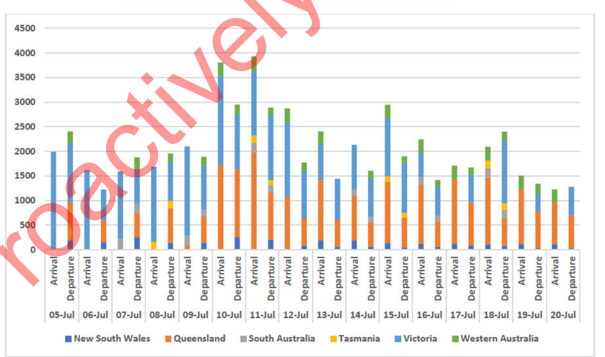
Figure 1: Passengers on Flights Between New Zealand and Australia by Day