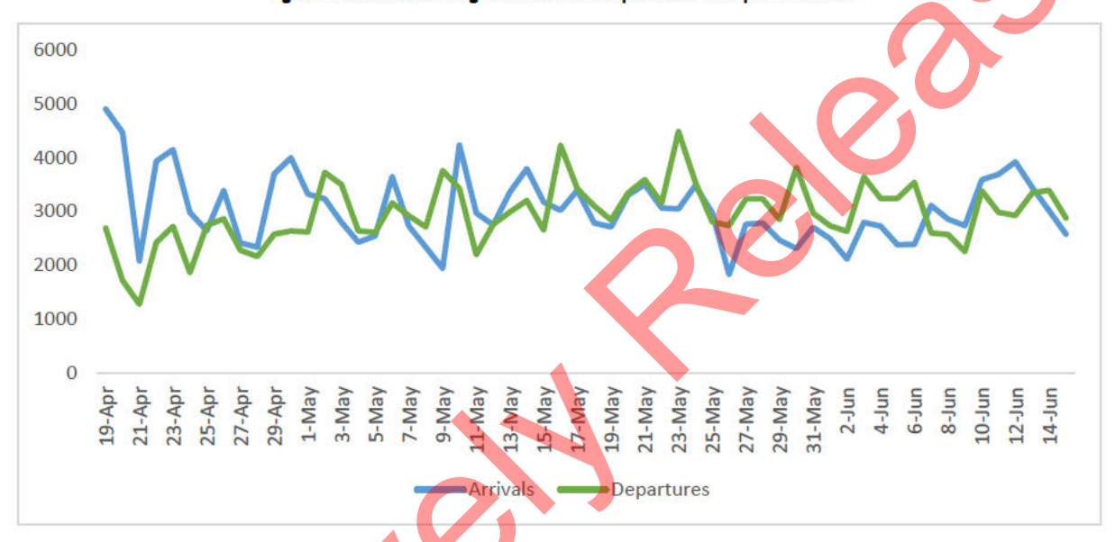
Figure 1: International Flight Arrivals and Departures - 19 April to 15 June

There were 4,696 more people arriving in New Zealand than departed. For travel between Australia and New Zealand there were more arrivals than departures. For the Asia, Pacific and America regions there have been more departures than arrivals.