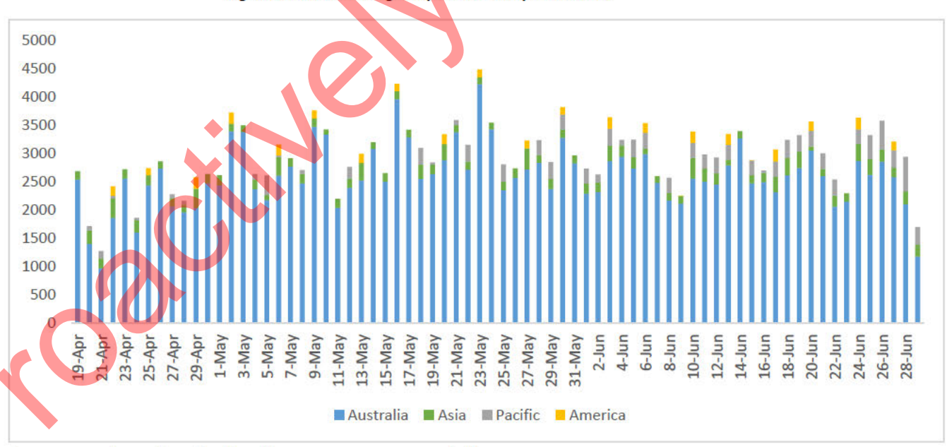
Figure 3: International Flight Departures - 19 April to 29 June

Departures from New Zealand by next port were as follows: