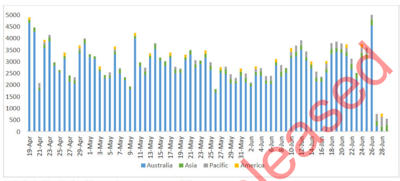
Figure 2: International Flight Arrivals - 19 April to 29 June

Arrivals to New Zealand by previous port were as follows: