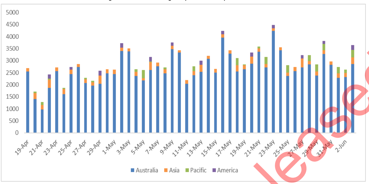
Figure 3: International Flight Departures - 19 April to 3 June

Thank you to the New Zealand Customs Service for contributions to this insights section.