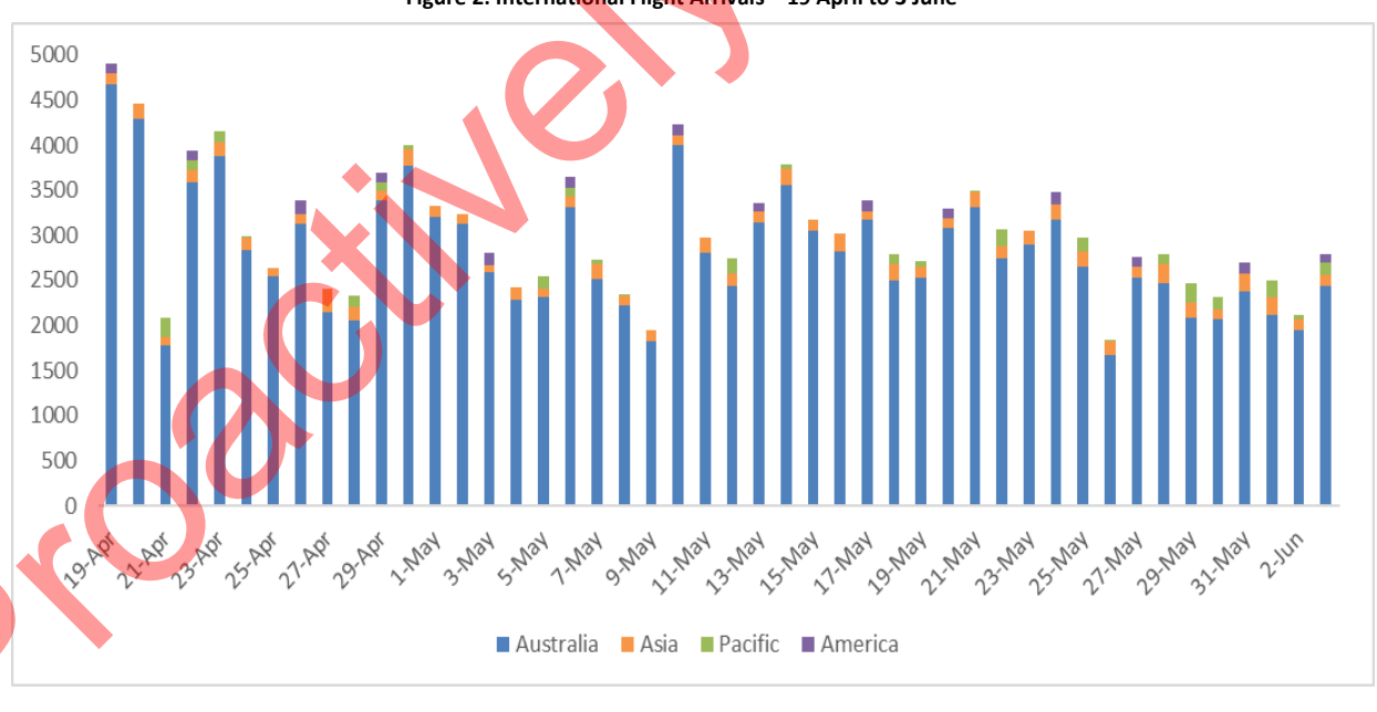
Figure 2: International Flight Arrivals – 19 April to 3 June

A breakdown of these is shown below in figure 2 (arrivals) and figure 3 (departures).