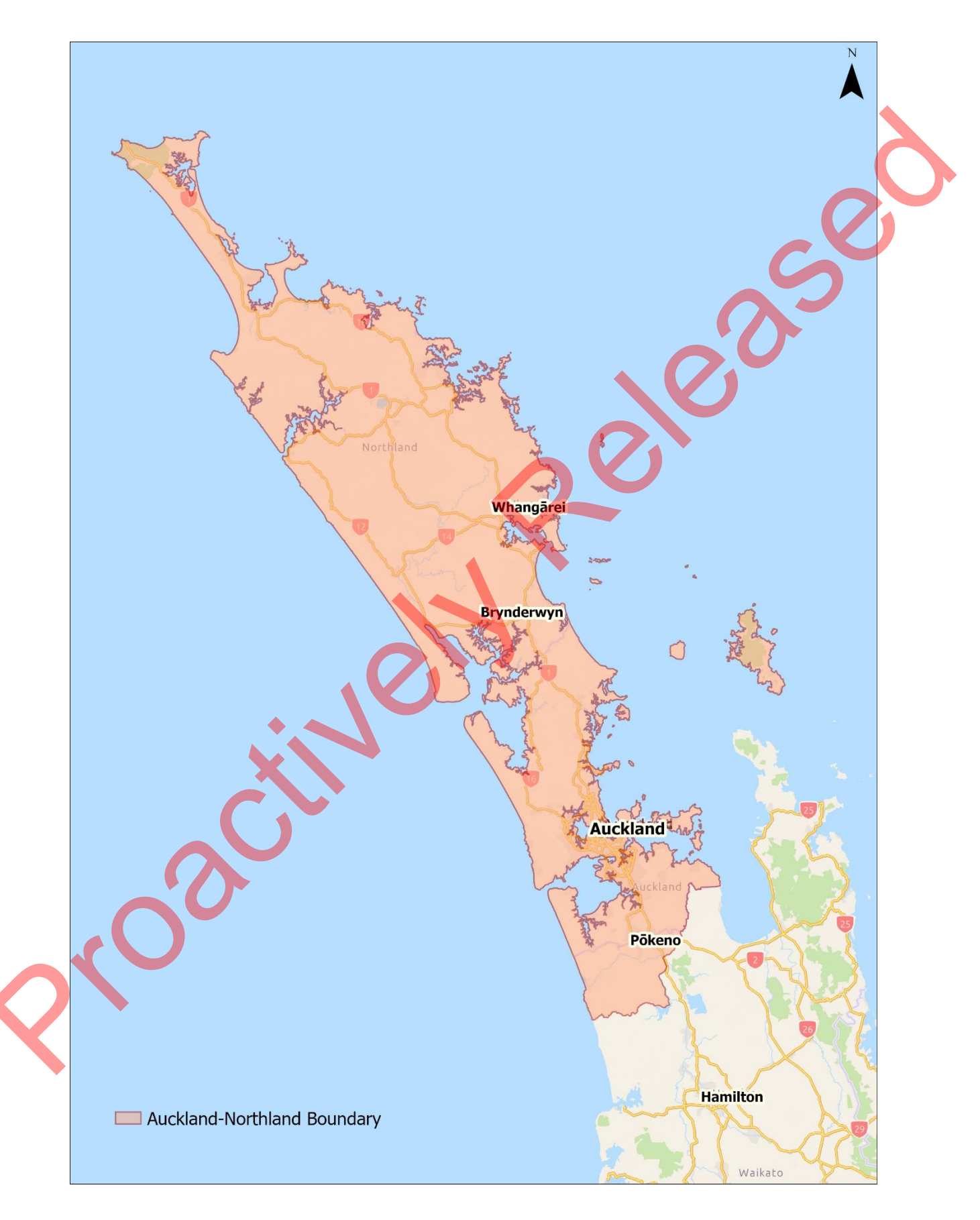
Appendix 4 – Map of possible Auckland and Northland Alert Level 4 area