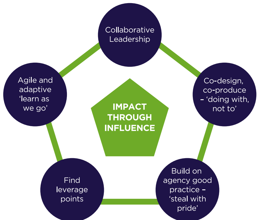
Diagram 1: Collective impact operating model

In August 2016, Prime Minister John Key launched the three frameworks for policy improvement that spearhead