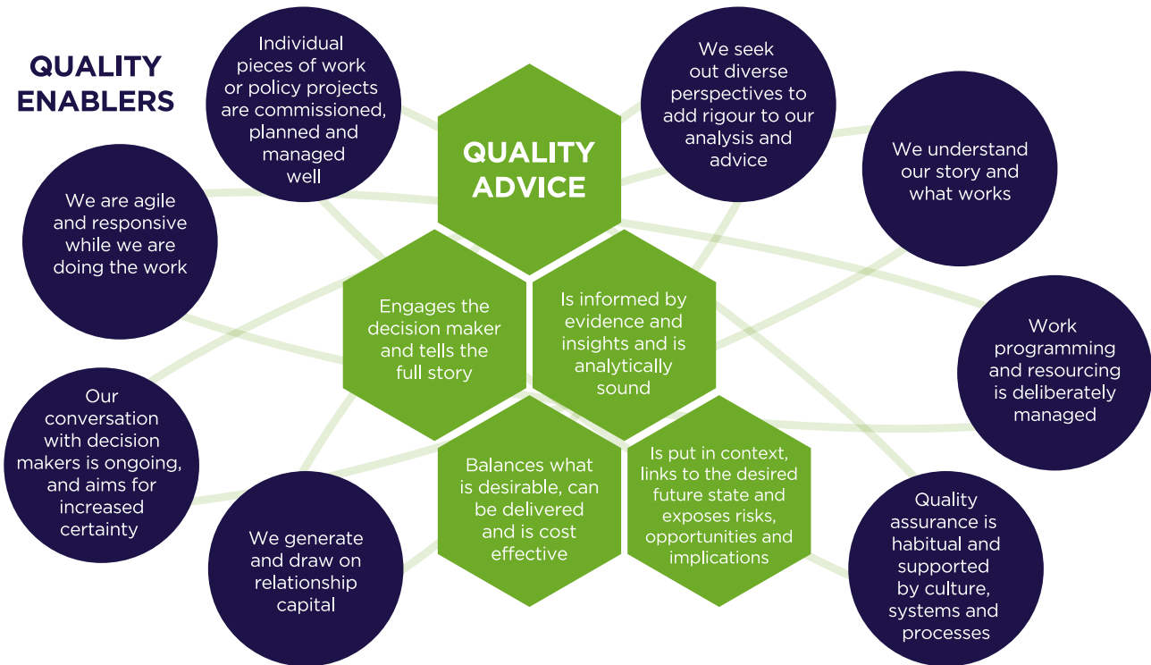
Diagram 2: Quality characteristics, enablers and acid tests of the Policy Quality Framework

the Policy Project’s approach. They focused on: skills; capability; and quality.