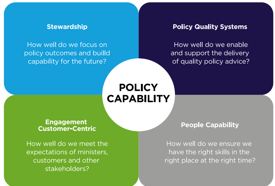
Diagram 4: The four dimensions of the Policy Capability Framework