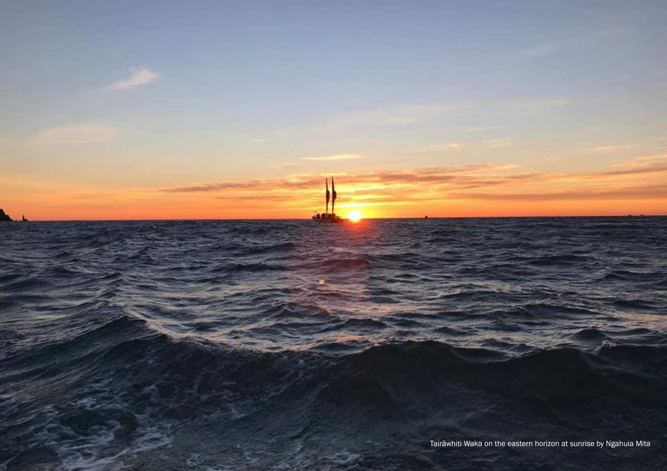
Tairāwhiti Waka on the eastern horizon at sunrise