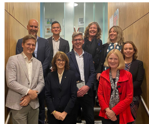
Above: FACS tour of Monash

"...with a steady turnover of Chief Scientists in different states, it was great to get back to in-person meetings again."