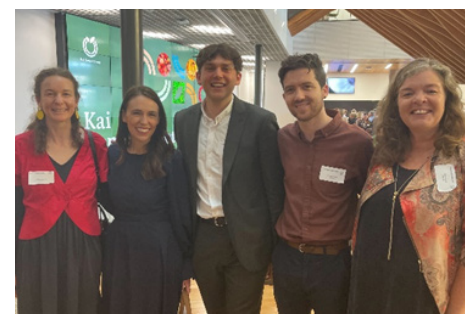
Top left: The team