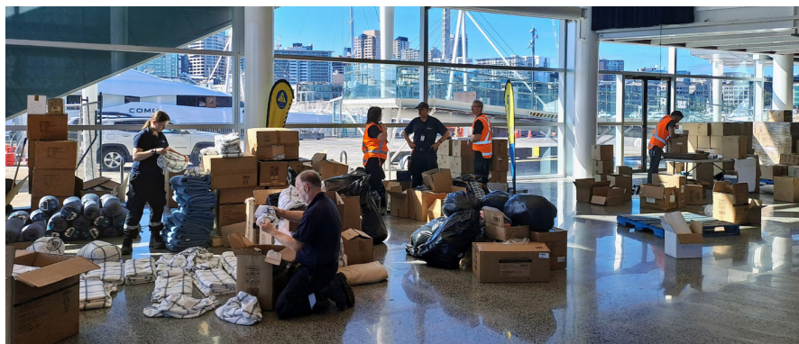
Image: Selwyn volunteers sorting supplies that had been returned from Auckland Civil Defence Centres so that it could be stored and reused.