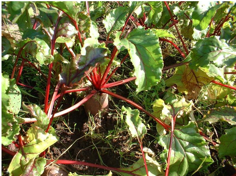
Figure 3 Vegetables such as beetroot are naturally high in nitrates, as well as protective factors such as anti-oxidants.

This is different than the MAV which is based on the concentration in drinking-water that is considered not to cause significant risk to health over a lifetime when consuming 2 litres of water a day.